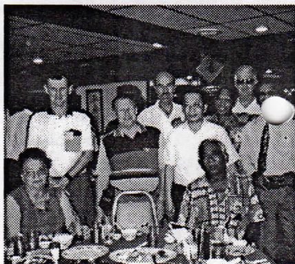
After lunch in Seremban