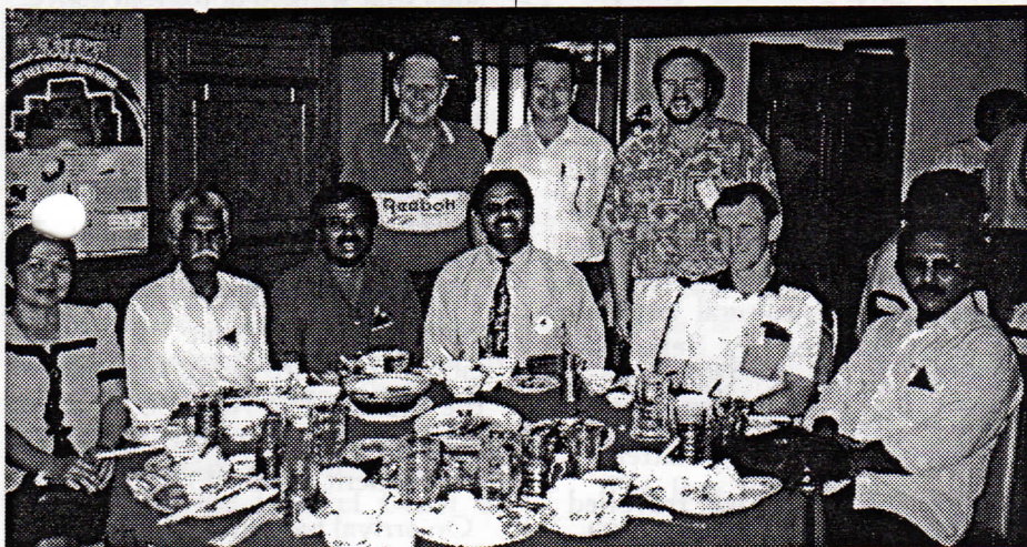
After yet another good lunch

Sunday – Off on the bus to Klang (a Malacca Straits port), through scenic countryside and 16-lane toll gates. Boarded a boat which resembled the African Queen minus pad-